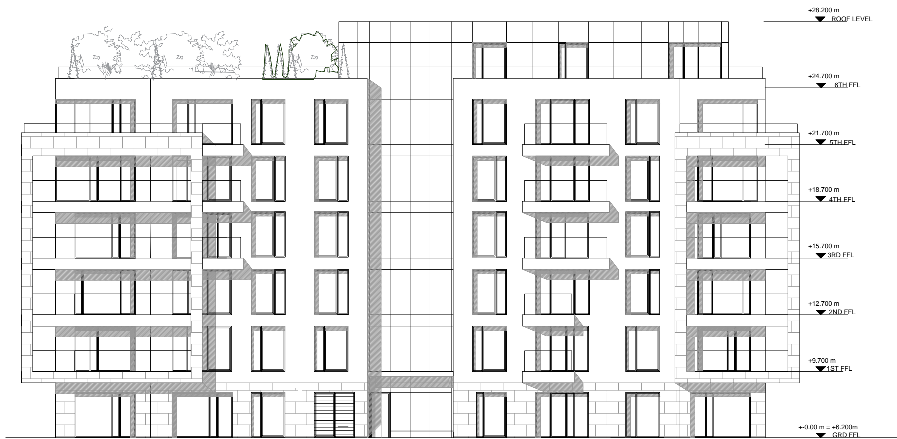
1 PROPOSED BLOCK 4 & 6 - ENTRANCE ELEVATION 1 : 200